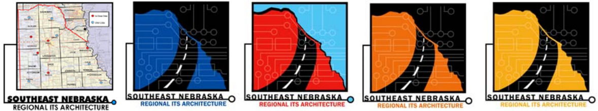
Figure 2: Typical Logos for SE Nebraska Regional ITS Architecture

5.3.3 Project Updates: The Project Team will develop a Project Update at key points throughout the study. The update will document project progress and outcomes. Electronic copies of the update will be posted on the project website and e-mailed to interested stakeholders.